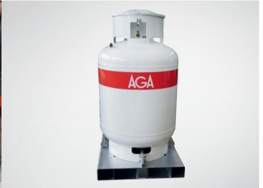
The Maxi propane cylinder can easily be lifted with a forklift.