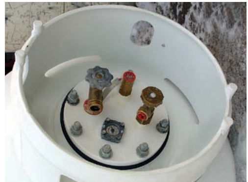
The Maxi cylinder has connections for both gas- and liquid taps.